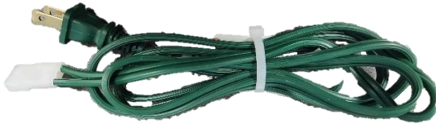
3. AC Power Plug